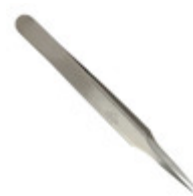
2SA Apex Tool Group TWEEZER POINTED MEDIUM 4.50"