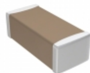
C1608X7R1C223M TDK Corporation CAP CER 0.022UF 16V X7R 0603