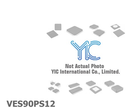
N/A AC/DC DESKTOP ADAPTER 12V 90W