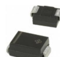
SMBJ60HE3/5B Vishay Semiconductor Diodes Division TVS DIODE 60VWM 107VC SMB