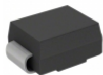
SMBJ64A Littelfuse Inc. TVS DIODE 64VWM 103VC SMB