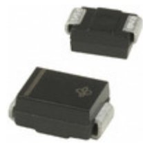
SMBJ60HE3/52 Vishay Semiconductor Diodes Division TVS DIODE 60VWM 107VC SMB