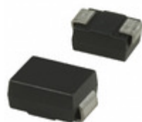
SMBJ64A Fairchild/ON Semiconductor TVS DIODE 64VWM 103VC SMB