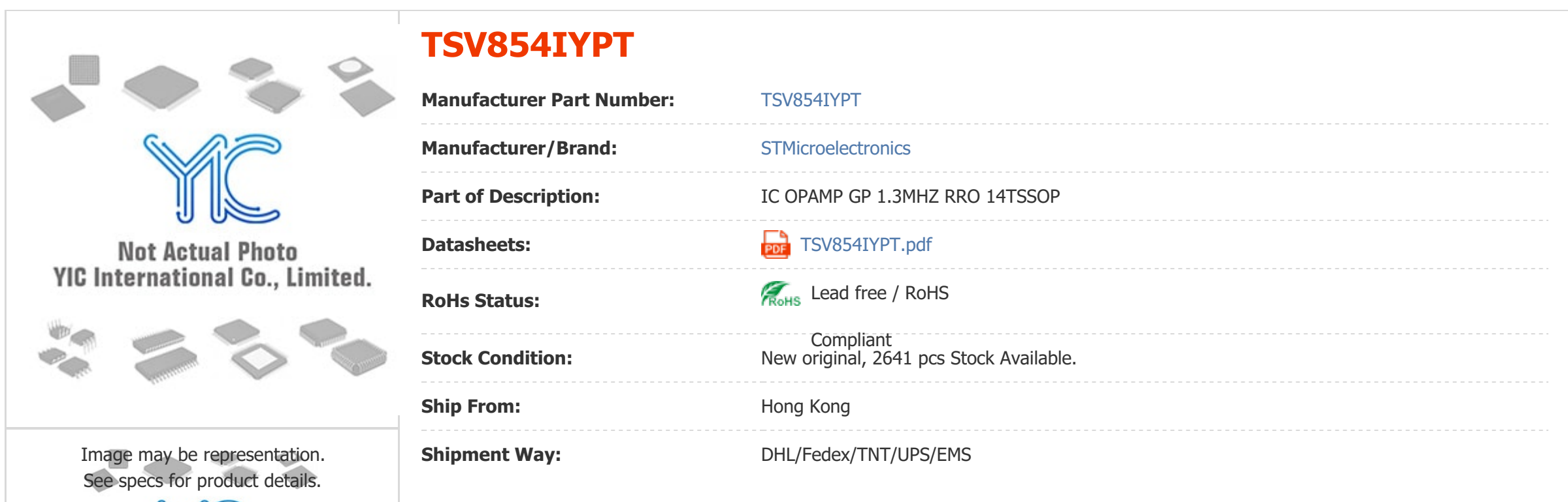
Image may be representation. See specs for product details.