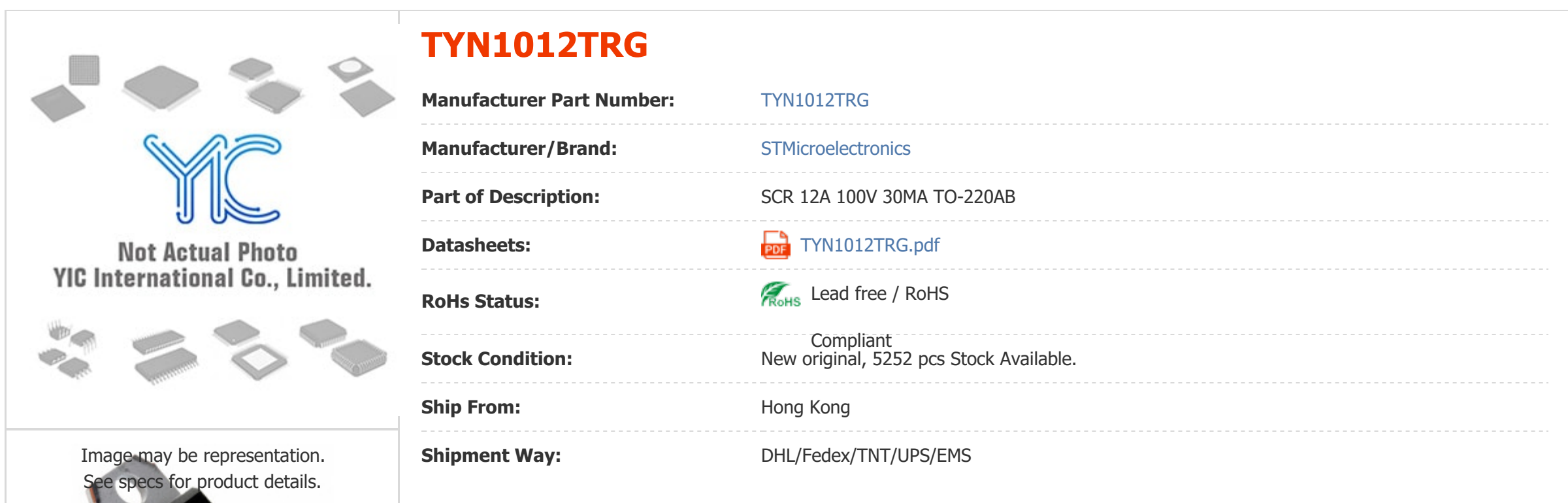
Image may be representation. See specs for product details.