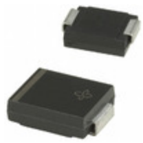
SMCJ85CAHE3/9AT Electro-Films (EFI) / Vishay TVS DIODE 85V 137V DO214AB