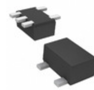
DMC562000R Panasonic Electronic Components TRANS 2NPN PREBIAS 0.15W SMINI5