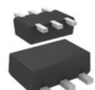
DMC564040R Panasonic Electronic Components TRANS PREBIAS DUAL NPN SMINI6