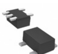
DMC562050R Panasonic Electronic Components TRANS 2NPN PREBIAS 0.15W SMINI5