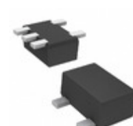
DMC5610L0R Panasonic Electronic Components TRANS 2NPN PREBIAS 0.15W SMINI5