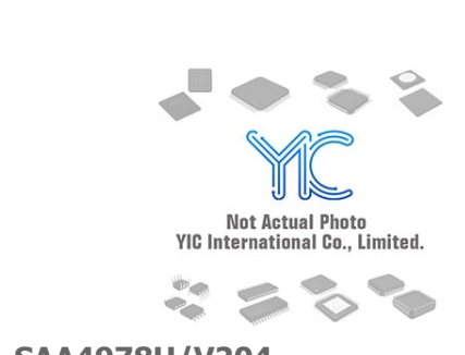
SAA4978H/V204 PHILIPS PHILIPS QFP208