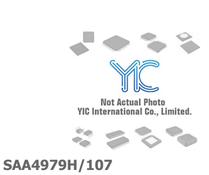
PHILIPS PHILIPS TQFP-128