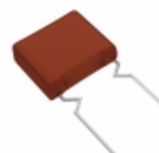
ECW-F2105JAQ Panasonic Electronic Components CAP FILM 1UF 5% 250VDC RADIAL