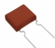
ECW-F2105RHA Panasonic Electronic Components CAP FILM 1UF 3% 250VDC RADIAL