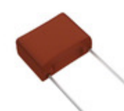
ECW-F2105HA Panasonic Electronic Components CAP FILM 1UF 3% 250VDC RADIAL