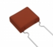
ECW-F2105JAB Panasonic Electronic Components CAP FILM 1UF 5% 250VDC RADIAL