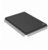
MB90F342ASPF-G-JNE1 Cypress Semiconductor IC MCU 16BIT 256KB FLASH 100QFP