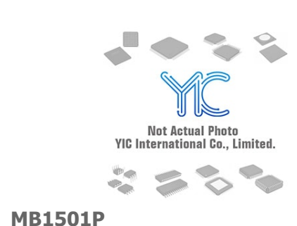
MB1501P FUJI MB1501P FUJI