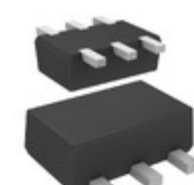
DMA564010R Panasonic Electronic Components TRANS PREBIAS DUAL PNP SMINI6