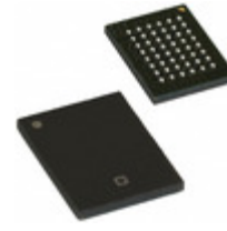
CY62157ELL-55BVXE Cypress Semiconductor Corp IC SRAM 8MBIT 55NS 48VFBGA