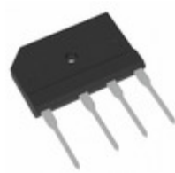
TS25P03GHC2G TSC (Taiwan Semiconductor) BRIDGE RECT 1P 200V 25A TS-6P