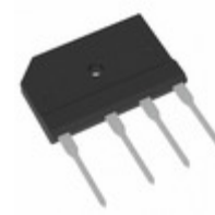
TS25P03G D2G TSC (Taiwan Semiconductor) BRIDGE RECT 1P 200V 25A TS-6P