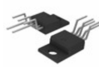
MC34167TV ON Semiconductor IC REG BUCK BOOST INV ADJ TO220