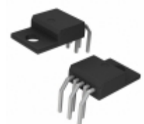
MC34167TH ON Semiconductor IC REG BUCK BOOST INV ADJ TO220