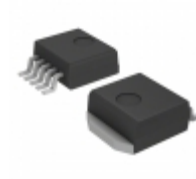
MC34167D2TR4G ON Semiconductor IC REG BUCK BOOST INV ADJ D2PAK