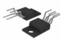
MC34167TVG ON Semiconductor IC REG BUCK BOOST INV ADJ TO220