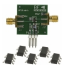
RF2314PCK RFMD KIT EVAL FOR RF2314