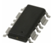
RF2317TR7 RFMD IC AMP HBT GAAS CATV CJ2BAT0