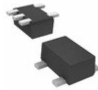
DMC562000R Panasonic Electronic Components TRANS 2NPN PREBIAS 0.15W SMINI5