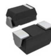
GS1K-LTP Micro Commercial Co DIODE GEN PURP 800V 1A DO214AC