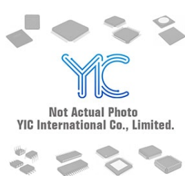
GS1K PANJIT PANJIT SMA