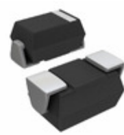
GS1K-TP Micro Commercial Co DIODE GEN PURP 800V 1A DO214AC