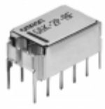
G6K-2P-RF DC3 Omron Electronics Inc-EMC Div RELAY RF DPDT 1A 3V