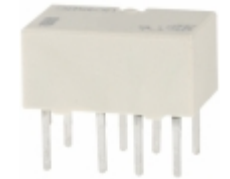
G6K-2P-Y DC5 Omron Electronics Inc-EMC Div RELAY TELECOM DPDT 1A 5V