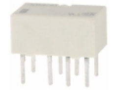
G6K-2P-Y DC3 Omron Electronics Inc-EMC Div RELAY TELECOM DPDT 1A 3V