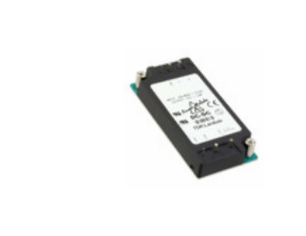
PH50S280-3.3 TDK-Lambda Americas, Inc. DC DC CONVERTER 3.3V 50W