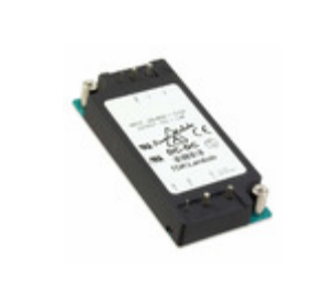
PH50S280-28 TDK-Lambda Americas, Inc. DC DC CONVERTER 28V 50W