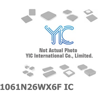
STM1061N26WX6F IC ST SOT-23-3