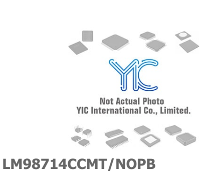
IC AFE 3CH 16BIT 45MSPS 48- TSSOP