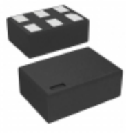
NC7SZ125L6X AMI Semiconductor / ON Semiconductor IC BUFF NONINVERT 5.5V 6MICROPAK