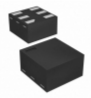
NC7SZ125FHX Fairchild/ON Semiconductor IC BUFFER UHS 3-STATE 6- MICROPAK