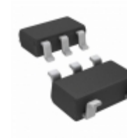
NC7SZ125M5 Fairchild/ON Semiconductor IC BUFF TRI-ST UHS N-INV SOT23-5