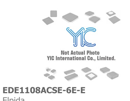
Elpida EDE1108ACSE-6E-E Elpida