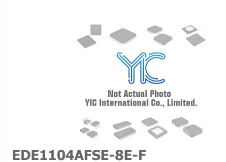
ELPIDA EDE1104AFSE-8E-F ELPIDA