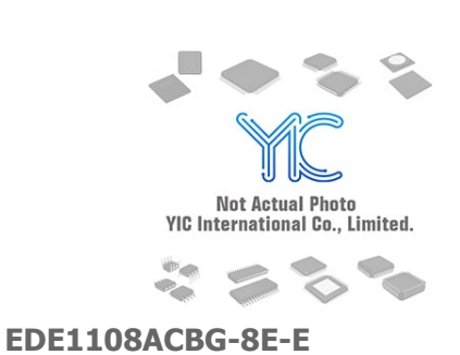
ELPIDA EDE1108ACBG-8E-E ELPIDA