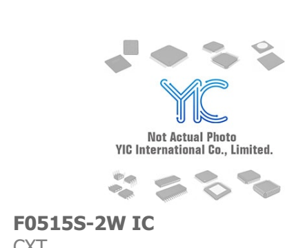
CXT CXT SIP-4