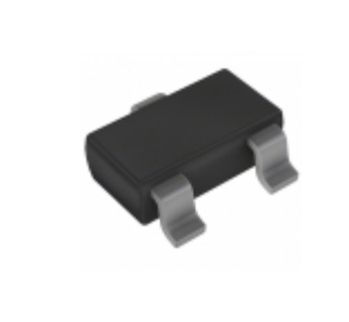
AP1703BWG-7 Diodes Incorporated IC MPU RESET CIRC 4.38V SC59-