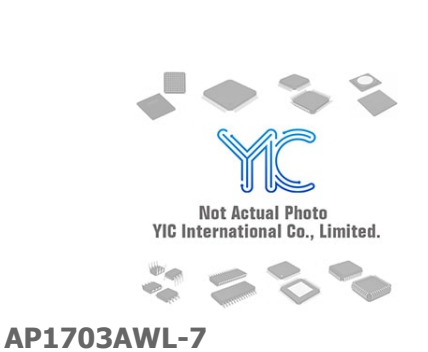
DIODES AP1703AWL-7 DIODES