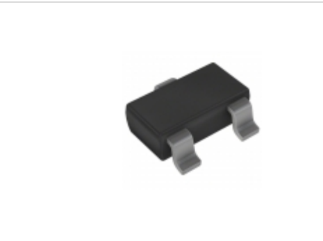
AP1703AWG-7 Diodes Incorporated IC MPU RESET CIRC 4.63V SC59-