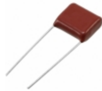
ECQ-E2125JF Panasonic Electronic Components CAP FILM 1.2UF 5% 250VDC RADIAL