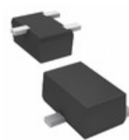
DRA5123Y0L Panasonic Electronic Components TRANS PREBIAS PNP 150MW SMINI3