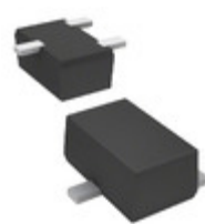
DRA5115T0L Panasonic Electronic Components TRANS PREBIAS PNP 150MW SMINI3