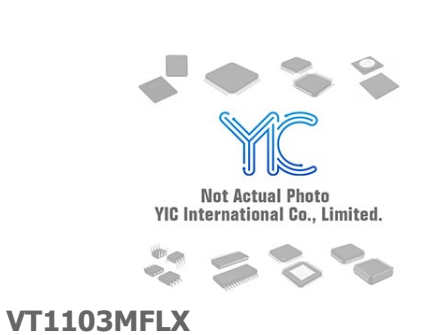
VOLTERR VT1103MFLX VOLTERR