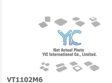
VOLTERRA VT1102M6 VOLTERRA