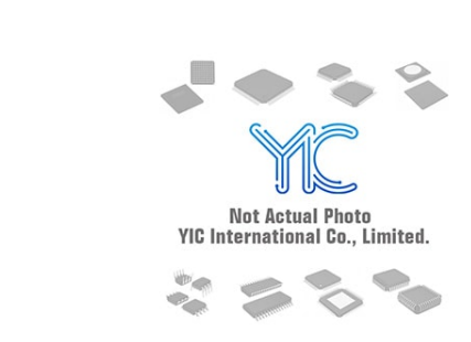
ZX297520M ZTE ZTE SMD