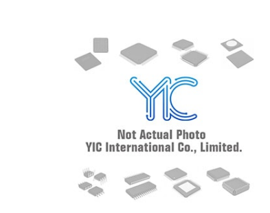
ZX297520 ZTE ZTE BGA