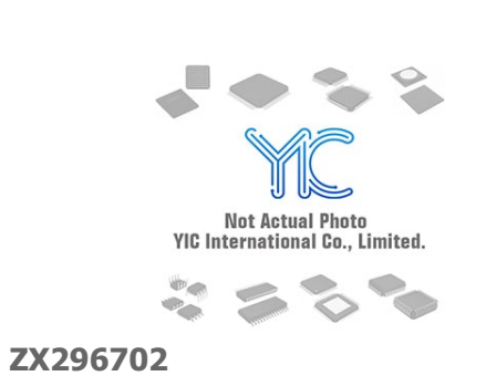
ZTE ZTE BGA1919