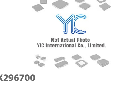
ZX296700 Ztw Ztw BGA