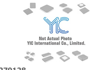
ZX279128 ZXIC ZXIC BGA