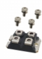
APT25GLQ120JCU2 Microsemi Corporation PWR MOD IGBT4 1200V SOT227