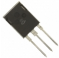
APT25GN120B2DQ2G Microsemi Corporation IGBT 1200V 67A 272W TMAX