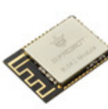
TEL0120 DFRobot DFROBOT BLE4.1 MODULE