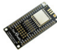
TEL0122 DFRobot FIREBEETLE COVERS-LORA RADIO 915