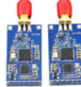
TEL0117 DFRobot LORA MESH RADIO MODULE - 868MHZ