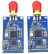
TEL0115 DFRobot LORA RADIO MODULE - 868MHZ