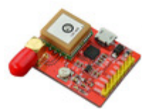
TEL0119 DFRobot USB/TTL RASPBERRY PI GPS TRACKER