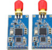
TEL0114 DFRobot LORA MESH RADIO MODULE - 433MHZ