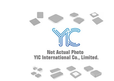
STABP01D STMicroelectronics IC PROCESSOR DIGITAL BASH 20SOIC