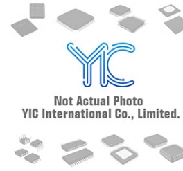
CY7C1041BV33-12ZC Original CY7C1041BV33-12ZC Original