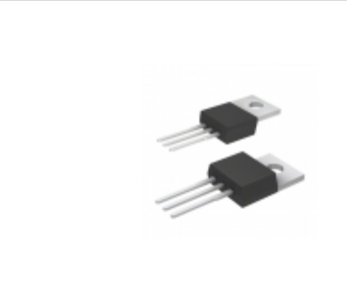
ON Semiconductor TRANS PNP DARL 80V 15A TO-220AB