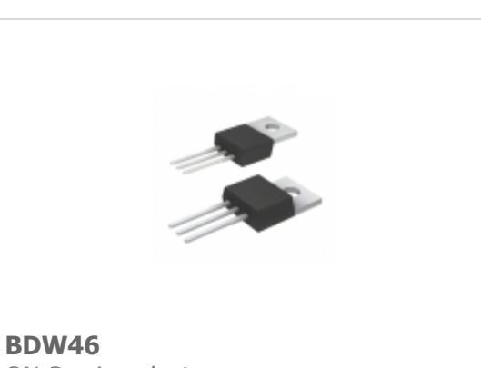
ON Semiconductor TRANS PNP DARL 80V 15A TO-220AB