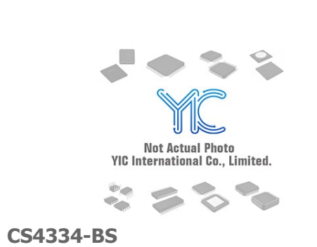
CRYSTAL CS4334-BS CRYSTAL