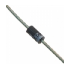
2EZ62D2/TR8 Microsemi Corporation DIODE ZENER 62V 2W DO204AL