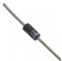
2EZ62D5E3/TR12 Microsemi Corporation DIODE ZENER 62V 2W DO204AL