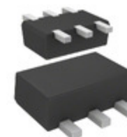
DMG564040R Panasonic Electronic Components TRANS PREBIAS NPN/PNP SMINI6