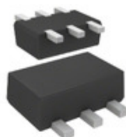
DMG564H20R Panasonic Electronic Components TRANS PREBIAS NPN/PNP SMINI6