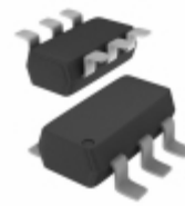
74HCT2G14GV,125 Nexperia USA Inc. IC SCHMITT TRIG DL INV 6TSOP