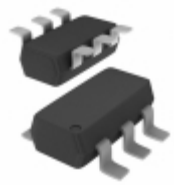
74HCT2G14GV-Q100H Nexperia USA Inc. IC INVERTER SCHMITT TRIG SC-74