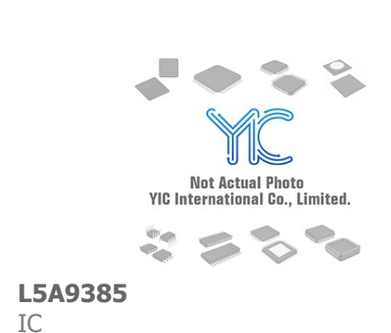
IC IC QFP