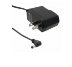
EPS120050-P5RP CUI, Inc. AC/DC WALL MOUNT ADAPTER 12V 6W