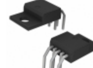
MC33166TH ON Semiconductor IC REG BUCK BOOST INV ADJ TO220