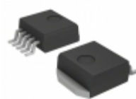
MC33167D2TR4G ON Semiconductor IC REG BUCK BOOST INV ADJ D2PAK