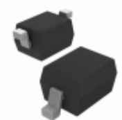
BA782S-E3-18 Electro-Films (EFI) / Vishay DIODE BAND SW 100MA SOD323