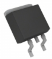
BA7820FP-E2 Rohm Semiconductor IC REG LDO 20V 1A TO252-3