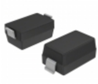
BA782-HG3-18 Vishay Semiconductor Diodes Division DIODE BAND SW 100MA SOD123