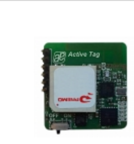
ACTIVE TAG KIT (USB DONGLE)