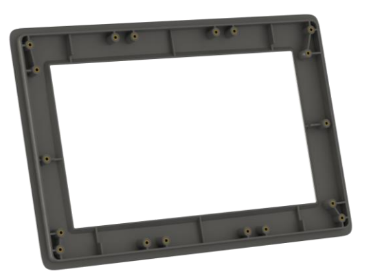
Bare 7.0" Bezel - Back