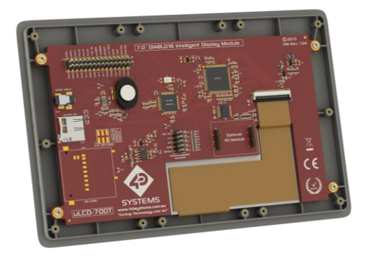
uLCD-70DT Mounted in 7.0" Bezel - Back