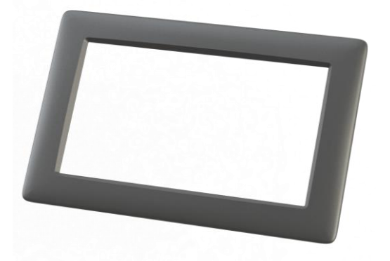
Bare 7.0" Bezel - Front