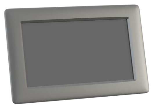
uLCD-70DT Mounted in 7.0" Bezel - Front