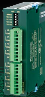
NEW Analog Output Unit Output: 4 channels AFP0RDA4