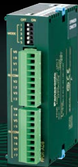
NEW Analog Input Unit Input: 8 channels AFP0RAD8