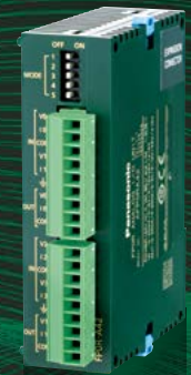
NEW Analog I/O Unit Input: 4 channels / Output: 2 channels AFP0RA42