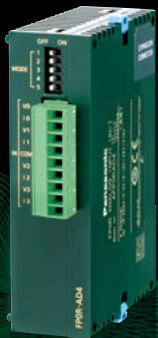
NEW Analog Input Unit Input: 4 channels AFP0RAD4