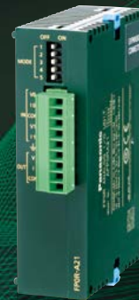
NEW Analog I/O Unit Input: 2 channels / Output: 1 channel AFP0RA21